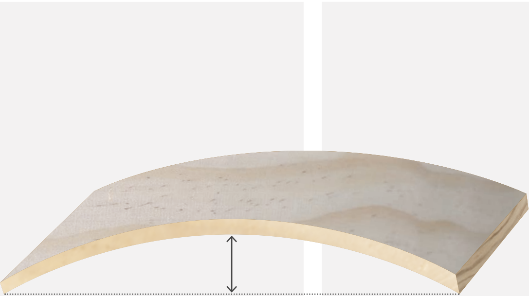
TABLE 2: ALLOWED CROOK