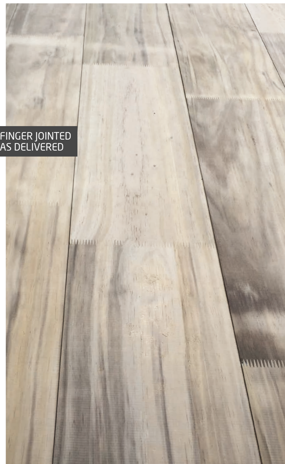
FINGER JOINTED AS DELIVERED