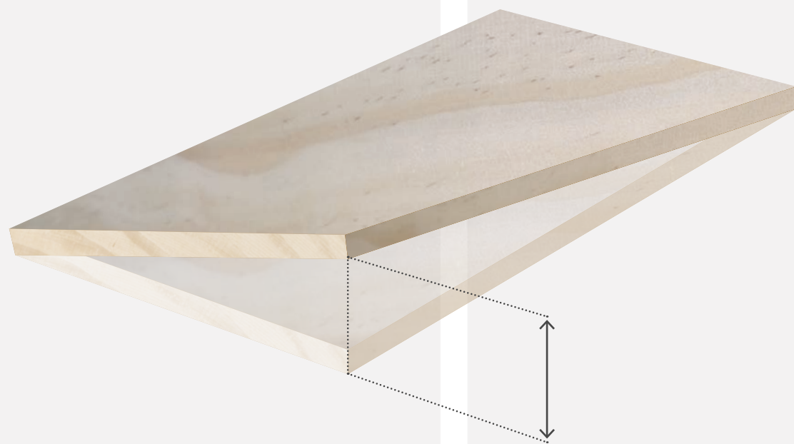
TABLE 4: ALLOWED CUPPING